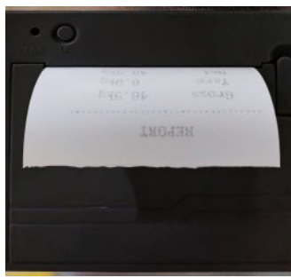
Accumulation data print out

Lithium Battery Charger Charging time: 4 hours